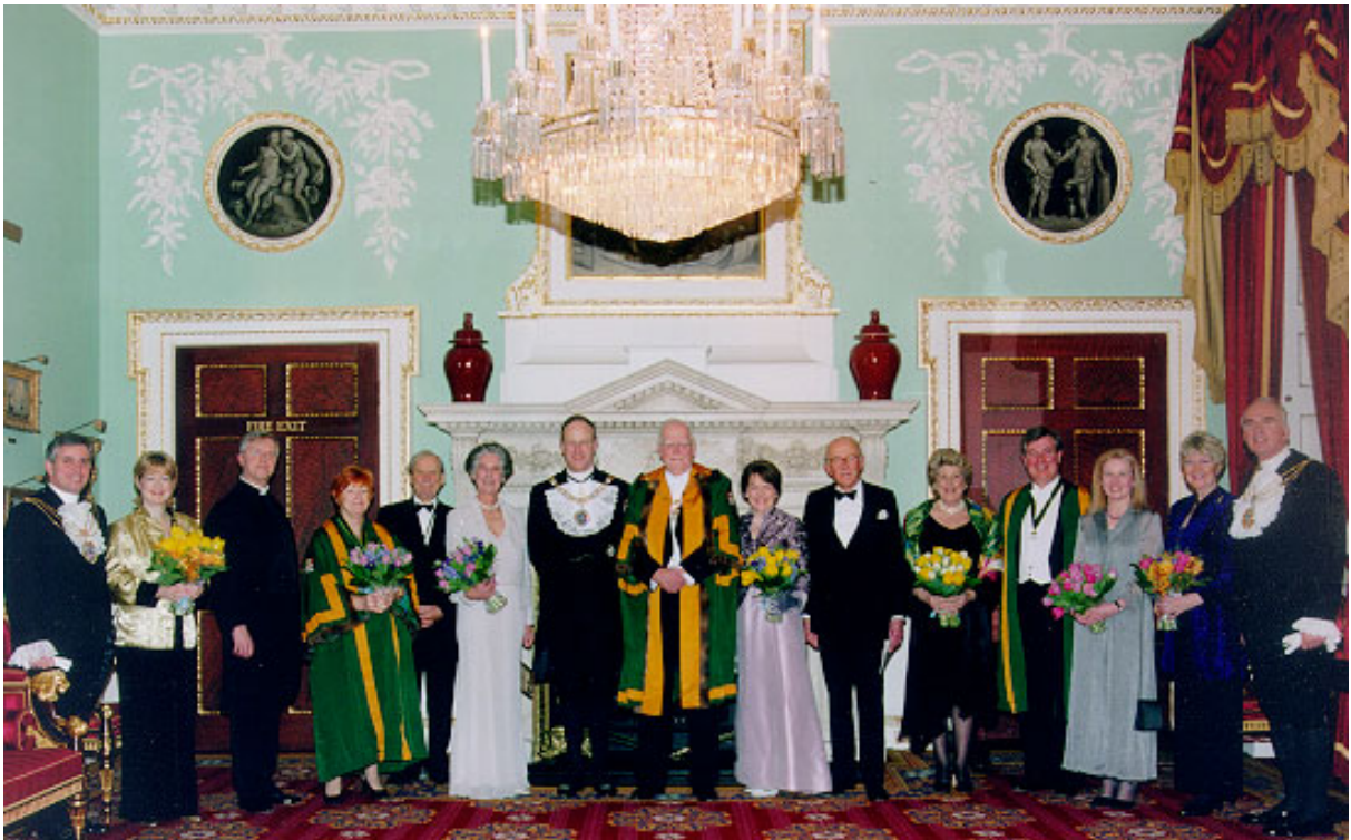
The Master and Wardens with The Lord Mayor and Guests on the occasion of the Mansion House Banquet on 20 February 2004

Meanwhile best wishes to all for Easter.